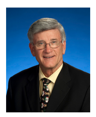
Senator Todd Gardenhire