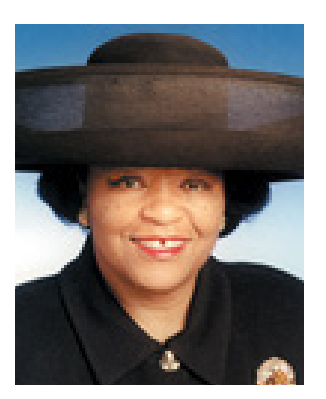
Senator Thelma Harper