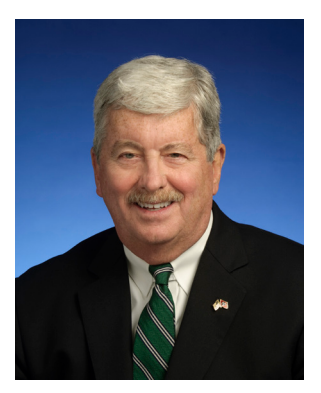
Lieutenant Governor Randy McNally Speaker of the Senate